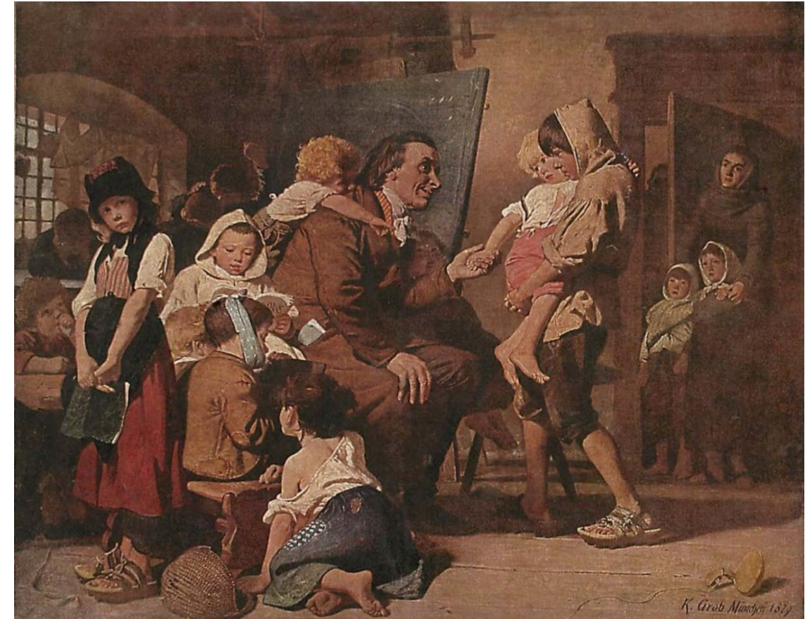
Konrad Grob - Pestalozzi bei den Waisenkindern in Stans.