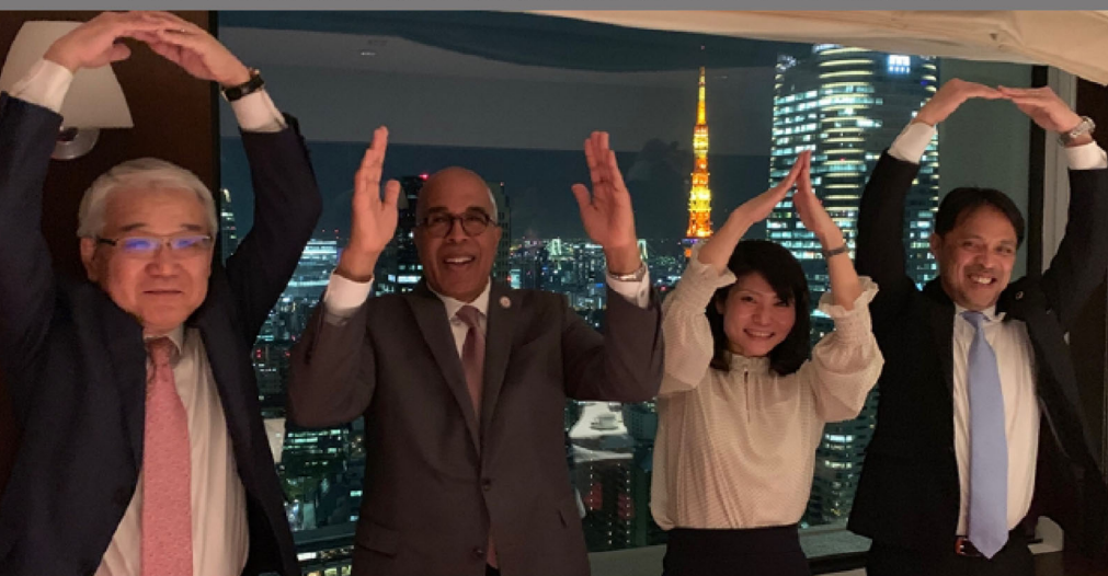
The College of Education and Human Ecology and University of Tsukuba

For Attendees in US: February 11, 2021 7:00PM-10:00PM Eastern Standard Time